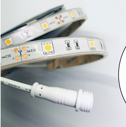
IL-TG-5050 Thinglow Reel with Waterproof Connectors